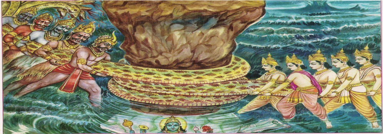
(2) The Beast of Bible Revelation 13 in pictorial language. It's about antichrist 666 the false Messiah (Maseeh Dajjaal)!